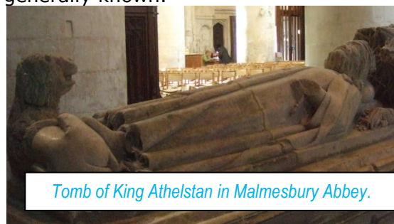
Tomb of King Athelstan in Malmesbury Abbey.

He was also closely associated with Freemasonry, which is not so generally known.