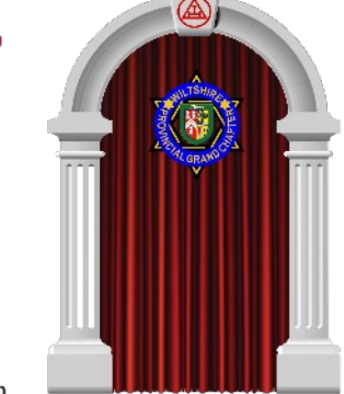
Step 1. Entered Apprentice Step 2. Fellowcraft Step 3. Master Mason Step 4. Companion