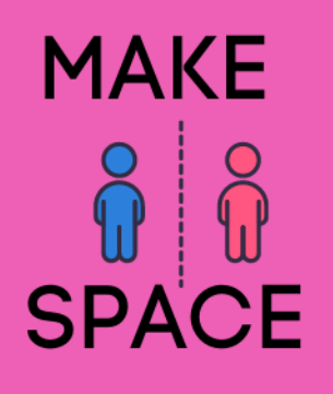
In touch > On line